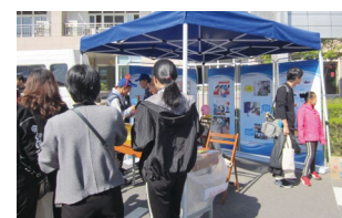
An exhibit booth outside the venue