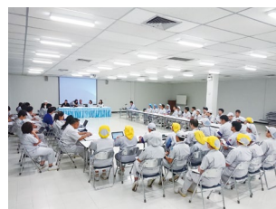
External certification audit for ISO 14001 (September 2018 in Thailand)

The MinebeaMitsumi Group is promoting the acquisition of ISO 14001 certification at each of its major sites worldwide. For newly constructed and recently acquired plants, we have begun environmental management activities based on the certification acquisition plans. NMB Sales Co., Ltd., a sales subsidiary, will seek to obtain certification in FY2019.