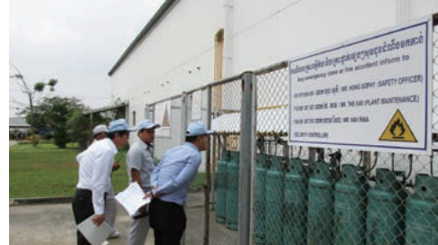
On-site ISO 14001 audit (Cambodia Plant)

Furthermore, in response to the September 2015 edition of the ISO 14001 standard, all plants and offices plan to complete the transition to certification under the 2015 standards by September 2018.