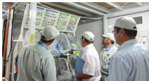
Audit at the Karuizawa plant

The Minebea Group is promoting the acquisition of ISO 14001 certification globally at each of its major sites. We have acquired certification for all of our plants worldwide. To maintain certification, we also conduct annual external audits by third-party organizations and internal audits by internal auditors. We also acquired certification for the Tokyo Head Office in June 2014 following its relocation in January 2013.