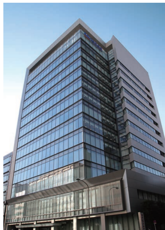
New Tokyo Head Office

In January 2013, in conjunction with the establishment of the Tokyo Research & Development Center, the Tokyo Head Office was relocated to Mita, Minato-ku, Tokyo.