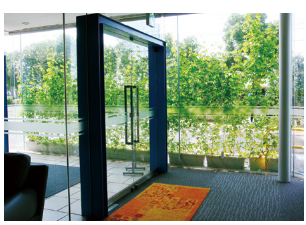
A "green" curtain used to save power (Fujisawa Plant)