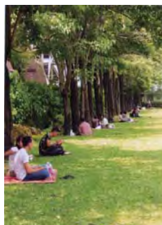
Photographed by: Ms. Uthumporn Khumput Bang pa-in Factory, Machine shop Spindle Motor 1 Div.