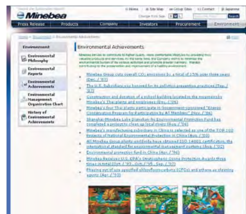
Top page of Minebea's web site covering environmental protection

For inquiries and comments on Minebea's environmental efforts, please see the back cover of this report.