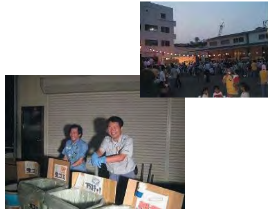
Members of the environmental disaster-prevention committee assisting separate collection

The Omori Plant held an annual summer festival. The festival aims at fostering private exchanges between employees and exchanges with local residents. The festival ended on a high note with lot of people including members of neighboring association, children, our partners and families of employees while our staff served at various refreshment booths. Members of the environmental disaster-prevention committee assisted people to separate trash for separate collection on the day.