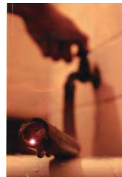
Bang pa-in Factory, Pelmecc Div.