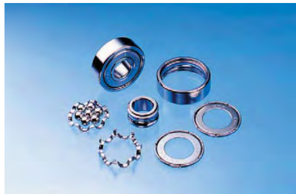
Bearing parts manufactured with in-house production machinery