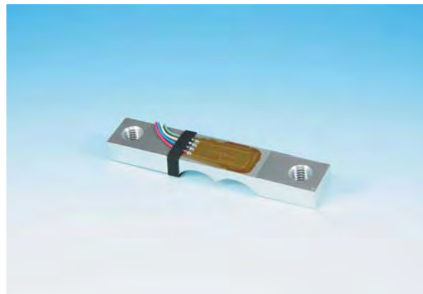
Strain gauge type force sensor