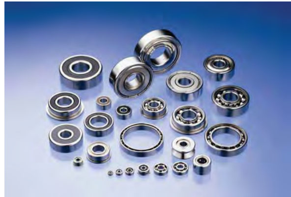
Miniature/small-sized ball bearings

We use lead-free solder and have eliminated hazardous substances such as phthalate compounds so that our products comply with the Restriction of Hazardous Substances (RoHS) directive.