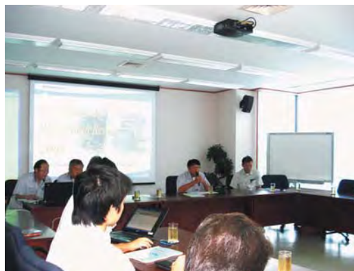
Management review (Thailand)