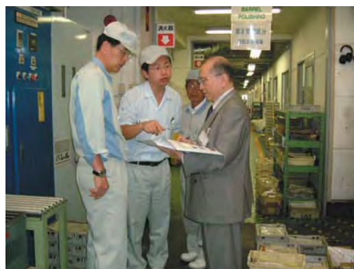
ISO 14001 certification renewal inspection (Karuizawa Plant)