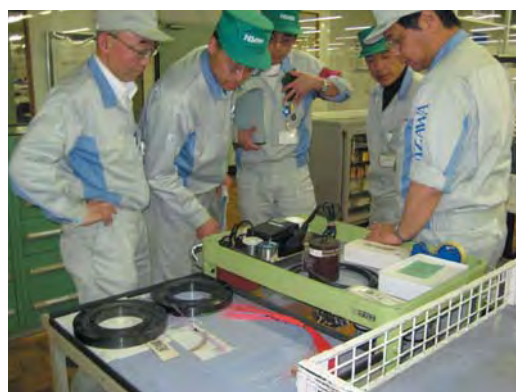
Implementation of internal environmental audit (Karuizawa Plant)