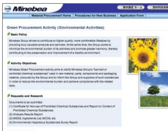
Top page of the green procurement section of Minebea's web site

http://www.minebea.co.jp/procurements/en/green/index/