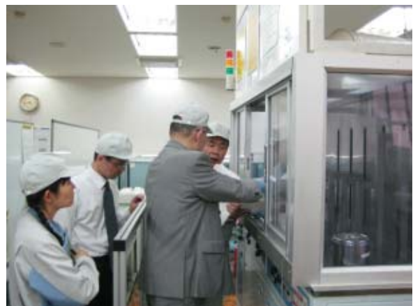
ISO 14001 certification renewal inspection (Matsuida Plant)