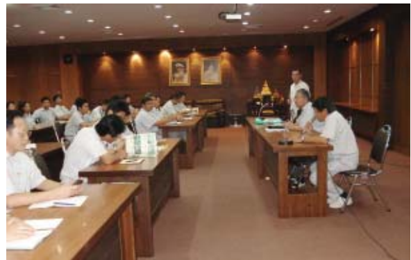
Environmental management meeting attended by the Director in Charge of Environmental Management (Thailand)