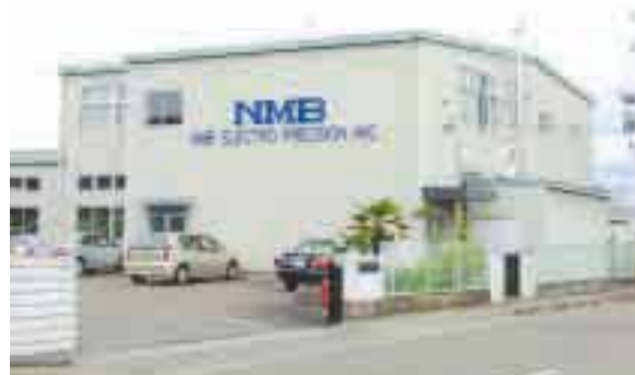
Sendai-based NMB Electro Precision

Subsidiary NMB Electro Precision Inc., based in Sendai, Japan, is participating in a support capacity in the Sendai City Beautification Program, a partnership involving the municipal government, individuals and corporations. The company's role includes assisting companies to clean up the areas around their factories and collecting waste.