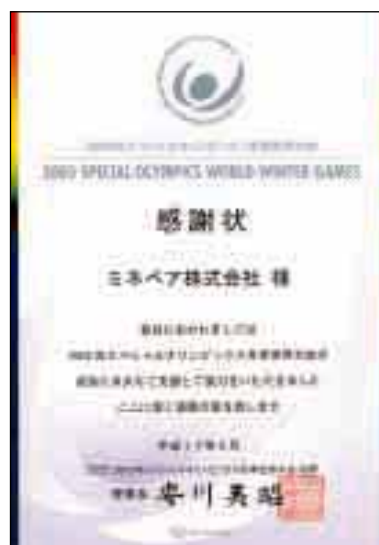
Letter of acknowledgment from the organizers of the 2005 Special Olympics World Winter Games

Minebea donated ¥5.0 million to the 2005 Special Olympics World Winter Games, which were held in Nagano, Japan, from February 26 through March 5, 2005. The Special Olympics aim to promote independence and participation in society for individuals with intellectual disabilities, as well as to enhance international exchange. Minebea's decision to make this donation reflects two factors: (a) its registered headquarters is in Nagano Prefecture, and (b) its core values include ensuring Minebea is welcome in local communities and contributing to global society.