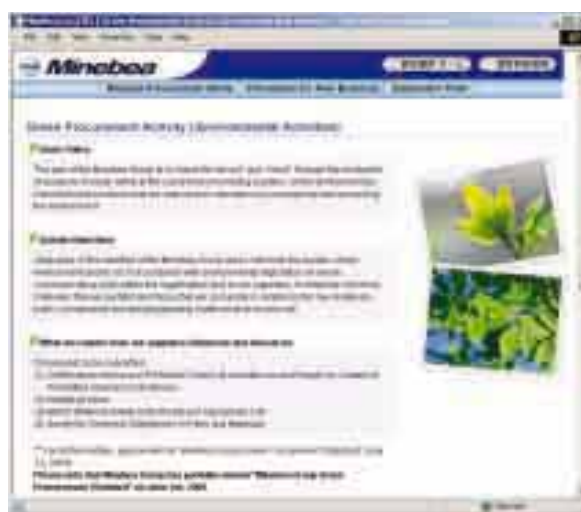
Top page of Minebea's green procurement web site

http://www.minebea.co.jp/procurements/en/green/index.html