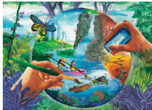
First Prize, Secondary School Level

As part of its celebrations for the 20th anniversary of its Thai operation and with the aim of encouraging greater awareness of environmental issues among Thai children and teens, Minebea organized an environment-themed art contest for primary, secondary and high school pupils in Ayutthaya and Lop Buri provinces. The contest attracted approximately 700 submissions. First, second and third prizes (scholarships) were awarded for the three levels. The artwork featured on the cover of the 2003 Minebea Group Environmental Report are the first prize-winning submissions from each level.