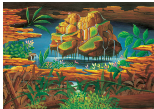
First Prize, High School Level