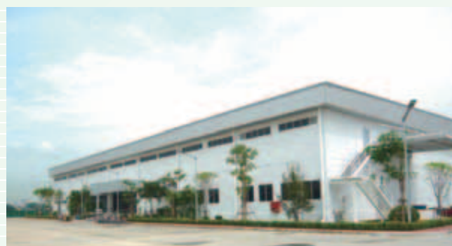
New cutting and pressing facility at the Bang Pa-in Plant in Thailand