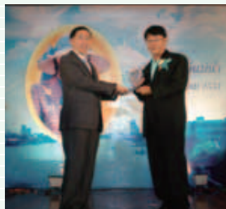
The Bang Pa-in Plant is awarded a prize for its cooperation in a project to protect the Chao Phraya River.