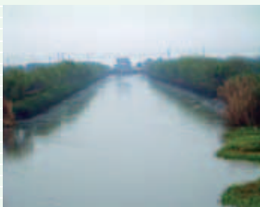
A local river after a dredging project supported by the Shanghai-Minebea Lake Dianshan-hu Environmental Protection Fund

We are actively involved in environmental activities in the communities where the Minebea Group has plants. In Thailand, home to our largest manufacturing base, we are honored with numerous awards every year in recognition of our efforts to reduce energy consumption and protect the environment. In China, we established the Shanghai-Minebea Lake Dianshan-hu Environmental Protection Fund in April 1996, with the aim