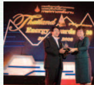
The Bang Pa-in Plant receives an award as an Outstanding Energy Conservation Factory in the 2008 Thailand Energy Awards