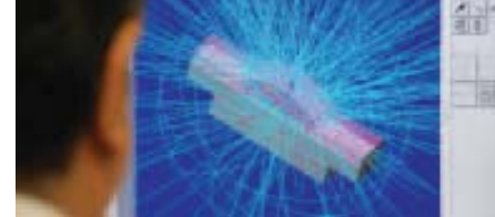
Optical simulation is essential to elemental technologies used in the manufacture of high-performance optical components.

For medium-sized LED backlights for car navigation systems—a newer market for Minebea—technologies to reduce thermal radiation are also essential. The heat reduction technologies we accumulated through the manufacture of fan motors and switching power supplies are enabling us to develop highly competitive products.