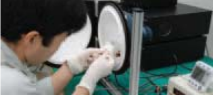
A wide range of equipment enables precise optical evaluation