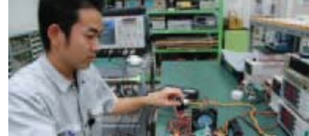
Performance evaluation supports efforts to enhance the reliability and attributes of circuitry developed in-house