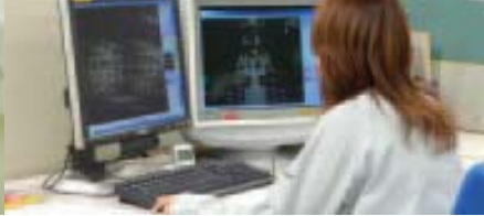
A range of two- and three-dimensional computer-assisted design (CAD) systems help shorten lead times from die design to production of the finished unit