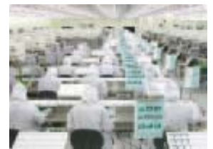
Clean room assembly line for LED backlights