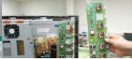
Advanced circuit design technologies facilitate highly efficient and reliable circuitry