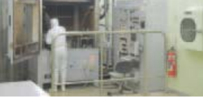
Minebea boasts advanced thin film coating technology and a clean room work area