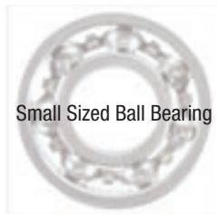
Small Sized Ball Bearing