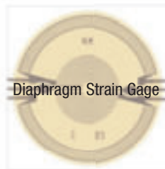
Diaphragm Strain Gage