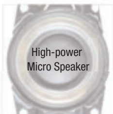
High-power Micro Speaker