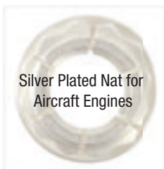
Silver Plated Nat for Aircraft Engines

For the past 60 years And the next 40 as we turn 100 Always building a better tomorrow for all It's what we do