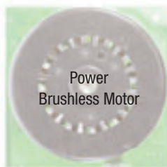
Power Brushless Motor