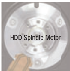
HDD Spindle Motor