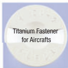
Titanium Fastener for Aircrafts