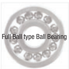
Full Ball type Ball Bearing