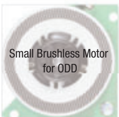
Small Brushless Motor for ODD

For the past 60 years And the next 40 as we turn 100 Always building a better tomorrow for all It's what we do