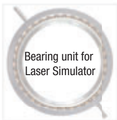
Bearing unit for Laser Simulator