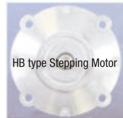
HB type Stepping Motor