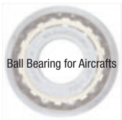
Ball Bearing for Aircrafts

ARCO Tower, 19th Floor, 1-8-1, Shimo-Meguro, Meguro-ku, Tokyo 153-8662, Japan Tel: 81-3-5434-8611 Fax: 81-3-5434-8601 URL: http://www.minebea.co.jp/