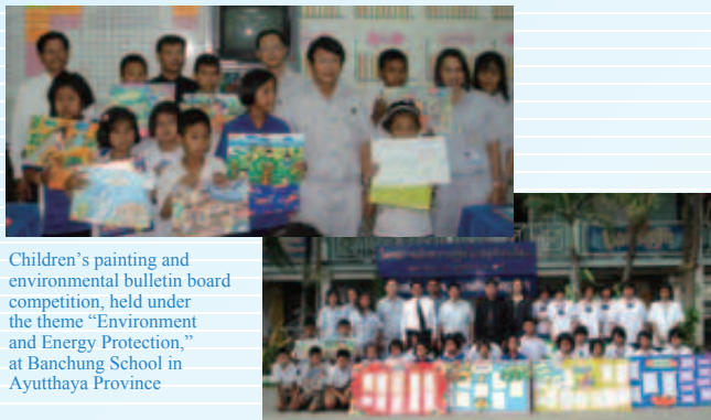
Children's painting and environmental bulletin board competition, held under the theme "Environment and Energy Protection," at Banchung School in Ayutthaya Province

The Takahashi Foundation was established in 1992 to celebrate the 10th anniversary of our operations in Thailand. Having added to the fund in 2007 local Minebea Group companies raised the fund to 80 million baht through special donations to commemorate a quarter-century of Minebea in Thailand. At present, the Foundation offers scholarships to impoverished students studying science and technology. To date, scholarships have been awarded to more than 500 students. The Foundation has also initiated a lunch fund project for needy primary school students and an environmental education project.