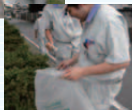
Tree-planting events near Minebea Plant's in Sendai, Japan