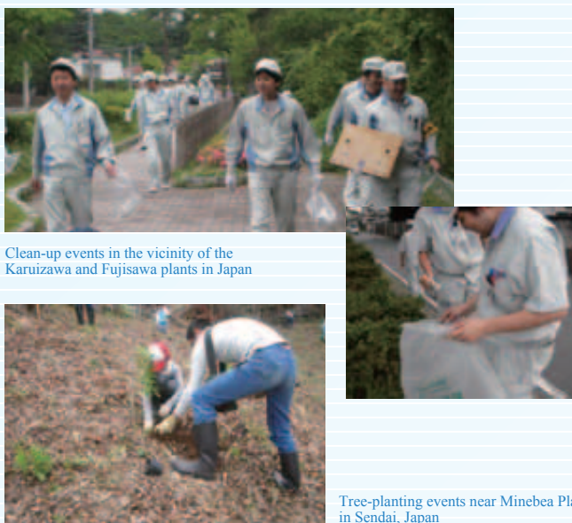
Clean-up events in the vicinity of the Karuizawa and Fujisawa plants in Japan