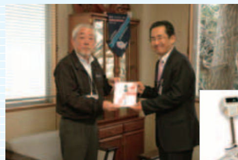
Presentation ceremony at the Fujisawa mayor's office

During the period under review, Minebea donated wheelchair scales designed and manufactured in-house to the social welfare divisions of the Fujisawa and Karuizawa city governments. These scales allow individuals in wheelchairs to weigh themselves without assistance.