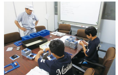
Students enjoy a work experience program at the Yonago Plant

The Yonago Plant welcomed two second-year students from nearby Minokaya Junior High School as part of the school's work experience program. The students commented that it was their first experience on a manufacturing plant floor, and though they had a hard time adjusting to the new environment, they realized the importance of work along with its enjoyable and challenging aspects. Additionally, plant employees acted as guest teachers for special science lessons at Minokaya Elementary School.