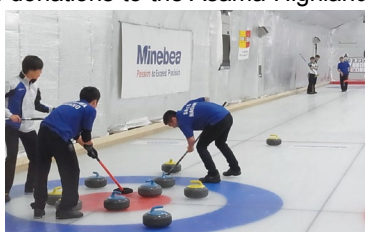
The Minebea Cup curling tournament

As part of its amateur sports promotion, the Karuizawa Plant supports curling through donations to the Asama Highland Sports Club, an incorporated nonprofit organization. The monetary donations assist the club in holding curling competitions and support junior and wheelchair teams.