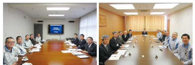
Regular community discussions (left: Karuizawa Plant; right: Yonago Plant)

The Yonago Plant held its first regular discussion in January 2016 at which participants exchanged views on local community activities, school-related issues, and exchanges among local businesses.