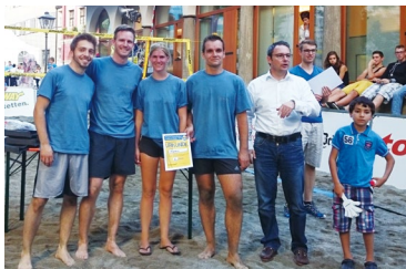
Employees participate in a volleyball competition

The summer festival was started 13 years ago as a way to provide entertainment to local residents during the summer vacation. myonic supports the festival each year by fielding an employee team in the sports competition and through other activities.