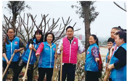
Employees volunteer for tree-planting activities

At the Shanghai Plant, employee volunteers are taking the lead in collecting and donating bags, books, and other necessities to victims living in regions struck by earthquakes. The plant also donates to musical concerts sponsored by local business associations, and plant employees participate in various other activities to support the development of the local community.