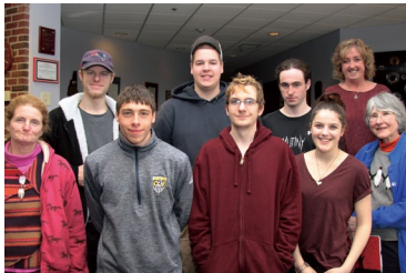
Students participate in the vocational education program

The program was planned jointly by the high school and NHBB to complement the high school curriculum with technical education at the plant. The students gained practical experience engaging in various tasks, from working with materials to making the finished products, while also learning about how to make improvements and use teamwork to solve problems.