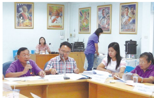
NMB-Minebea Thai holds a dialogue with members of the local community

In June 2015, the company also donated chicken feed and chickens to 95 impoverished households in Chiang Rak Noi, near the Bang Pa-in Plant, as part of a program to help local households with inadequate income to become self-sufficient.