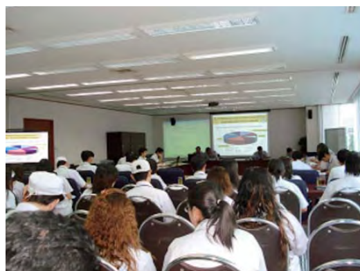
Management review (Thai Operations)