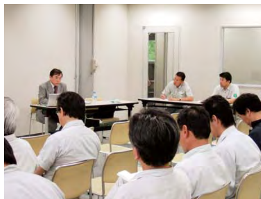
Audit of ISO 14001 by external examining authority (Hamamatsu Plant)