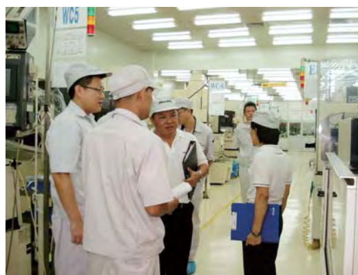
Site audit of ISO 14001 (Thai Operations)