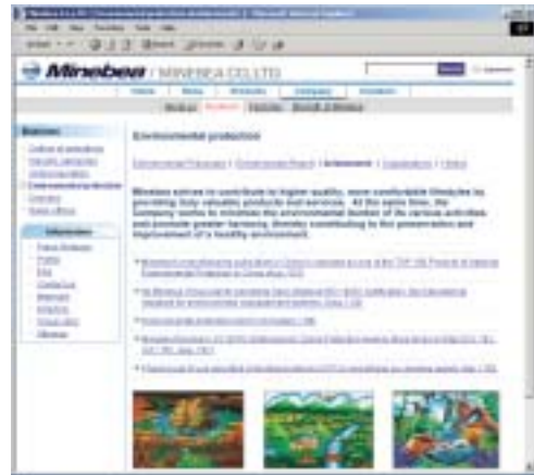
Top page of Minebea's web site

For inquiries and comments on Minebea's environmental efforts, please see the back cover of this report.