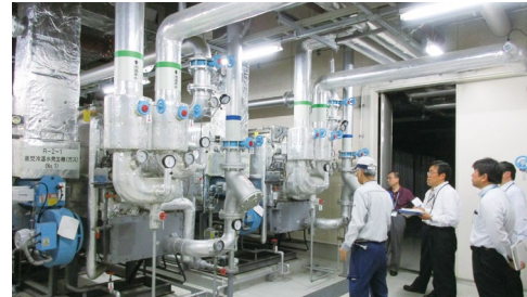
On-site ISO 14001 audit (Tokyo Head Office)

Furthermore, in response to the September 2015 edition of the ISO 14001 standard, all plants and offices plan to complete the transition to certification under the 2015 standards by September 2018.