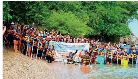
Participants in coral conservation activities

In December 2016, we lent our support to coral conservation activities in Samaesam island, Chonburi province with the aim of assisting protection of the ocean ecology. Approximately 100 employees took part in planting 140 coral polyps in the ocean at a marine research facility on the island.