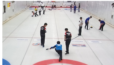
The Minebea Cup curling tournament

As part of its amateur sports promotion, the Karuizawa Plant supports curling through donations to the Asama Highland Sports Club, an incorporated nonprofit organization. The monetary donations assist the club in holding curling competitions and support junior and wheelchair teams.