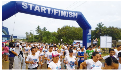
Participants in the charity marathon

and educational materials for local schools. The event was held for the fourth time in April 2017, and 817 people took part. The construction of two classrooms at elementary schools in the city is planned with the money collected through event t-shirt sales and donations.