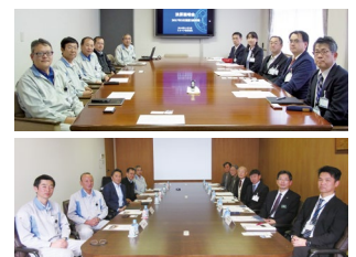
Meetings with the community (above: Karuizawa Plant; below: Yonago Plant)

The Yonago Plant held its second regular discussion in January 2017. On the day, we shared information about community activities of Yonago Plant, and also exchanged information about education, local activities, sports promotion, and business exchange.