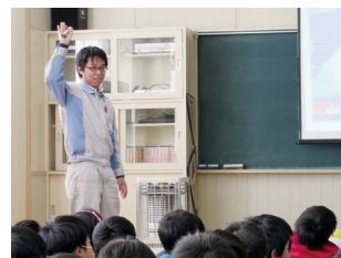
A staff member introduces Cambodia

Yonago Plant held classes at nearby Minokaya Elementary School, in Yonago city, Tottori Prefecture, on the topic of “international exchange.” A Cambodian employee from our company introduced the children to the culture, school system, food, and customs of Cambodia, and played the Cambodian version of rock-scissors-paper with the children, giving them a great opportunity to experience another culture. Moving forward, we will continue to show our support for schools in the region.