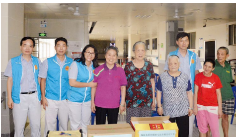
Social exchange at a facility for the elderly

Our Shanghai Plant conducts various activities to support community development. It dispatches employees to provide support at hospital when local people with disabilities visit hospital for a check-up.