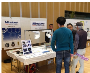
The Minebea exhibition booth

In FY2016, we took part in the Fukuroi City Fureai Yume Market, which supports “Local production for local consumption,” regional revitalization, and interaction between local producers, consumers, and residents. We produced a display of products, focusing on those from Hamamatsu Plant, and used it as an opportunity to explain the Group’s technological capabilities to local residents.